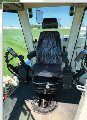
High comfort cab