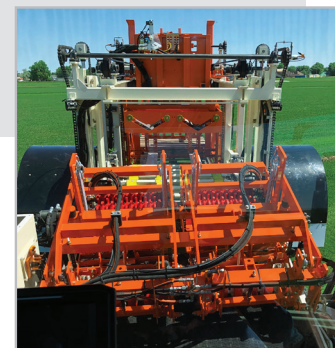
View out of the rear window