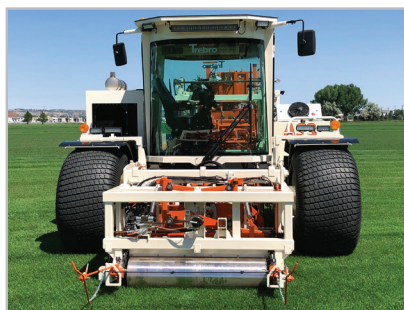
24 inch cutting heads with dual adjustable down pressure