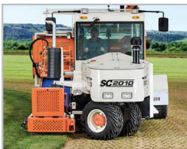
170 degree steering axle