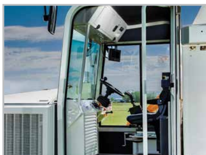
Deluxe cab with heat and air conditioning