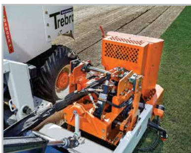
Floating head with adjustable down-pressure