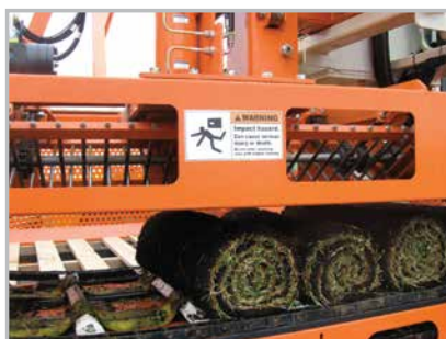
Proven Trebro stacking system